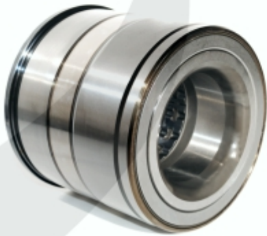
Truck Hub Bearing