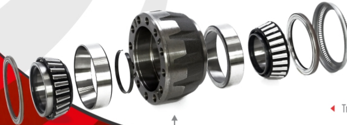
Truck Axle Module