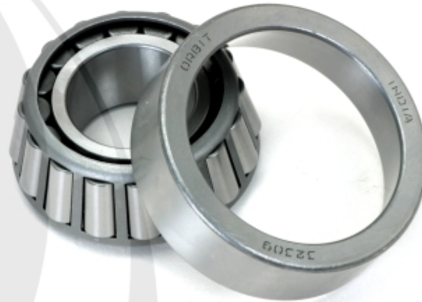
Tapered Roller Bearings